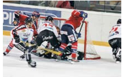
Finns are a sporting nation. Favourite sports include golf, cross-country skiing, alpine skiing, athletics, Nordic walking and ice hockey.

Finland is a large and sparsely populated country in the northernmost part of Europe. One of the largest countries in area in Europe, Finland's population is only 5.3 million - averaging 17 inhabitants per square kilometre. One million people live in the Helsinki Metropolitan Area and a total of 71% of the population live in urban areas.