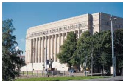
Finland is a stable welfare state and a democratic republic. The President, Parliament, local decision-makers and Finland's representatives to the European Parliament are elected by general elections where Finnish citizens over the age of 18 have the right to vote. Under certain conditions, foreign citizens residing in Finland also have the right to vote in municipal and European elections.

The year 2004 saw the entry into force of the Finnish Non-Discrimination Act. The Act's purpose is to foster and safeguard equality in working life and other areas of society. Finnish law also safeguards the equal rights of everyone, including ethnic minorities and different religious groups.