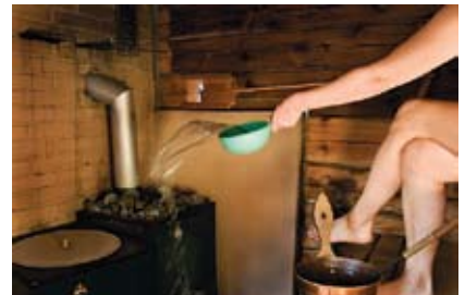
Refreshing and relaxing, the sauna has been a part of the day-to-day life and special occasions of Finns for centuries. Most urban Finns also prefer their home to be equipped with a sauna.