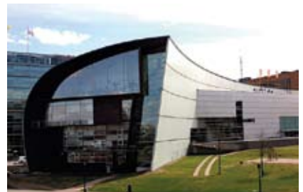
Finns appreciate and actively participate in many fields of culture. Our achievements in music, literature, fine arts, design and architecture are also known abroad.

The average size of a Finnish household is 2.1 people. Those living alone account for 39.3%. The average life expectancy for women is 81.3 years and for men 75.3 years.