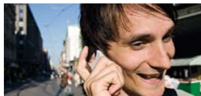
Finland is a nation of mobile phones and computers: 97% of Finns have a mobile phone. The world's leading mobile phone manufacturer Nokia is a Finnish company.

and the production of goods and services. Highly developed information technology has also revolutionised the flow of information.