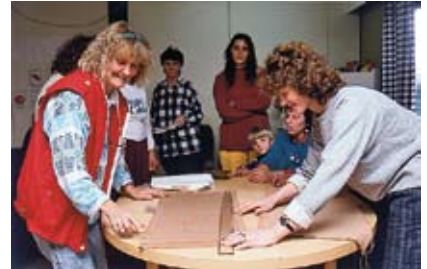
Finland is a nation of associations and other non-governmental organisations. Immigrants can also improve their language skills while getting to know the country and its people in a variety of associations in the fields of culture, sports and physical activity, different hobbies, recreation or even charity to name but a few.