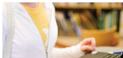
Finnish municipalities run libraries that can be freely used by the locals. They serve you by lending books and other material, assisting in information searches and providing access to the Internet on the library computers.

Research and innovations are supported. Finland is leading the development in many sectors of research