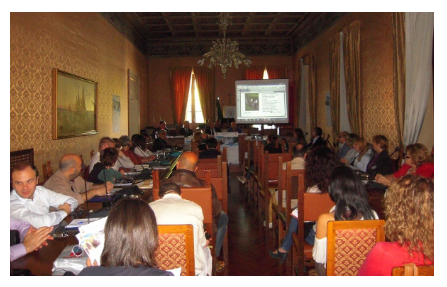
ERCIP Partners in Teramo, Oct. 2012.