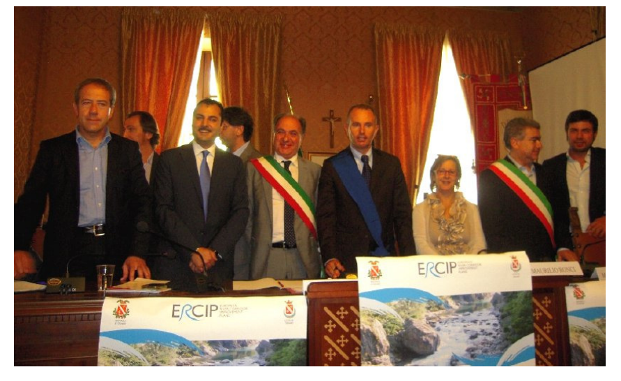
The Tordino River Memorandum of Understanding signing, Oct. 2012.

ERCIP Showcase Event, Lewisham, London - 25<sup>th</sup> June 2014